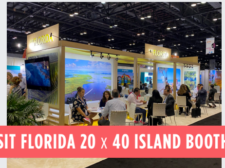
Sample: VISIT FLORIDA 20 x 40 ISLAND BOOTH